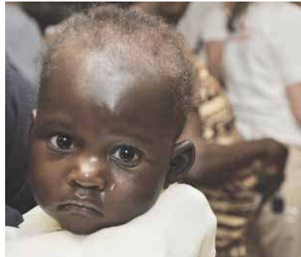
This malnourished child just arrived at a home for orphans.

What's growing here — knowledge and healthy children — will benefit generations to come.