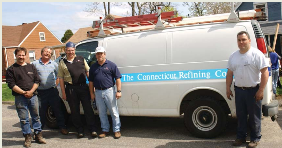
The professional technicians from "This Old House" repaired a heating system in 2003. Volunteers from the Connecticut Refining Co. (now part of Heating Oil Partners, L.P.) shown in photo above helped This Old House with this project.