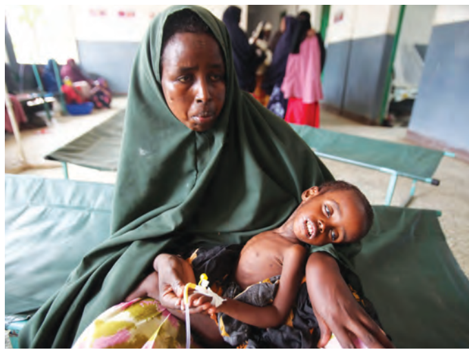
Many of those arriving at overcrowded refugee camps are in dire need of medical assistance including babies and young children especially at risk

Donations to the Africa Disaster Relief Fund will support our lifesaving efforts in Somalia and the surrounding region.