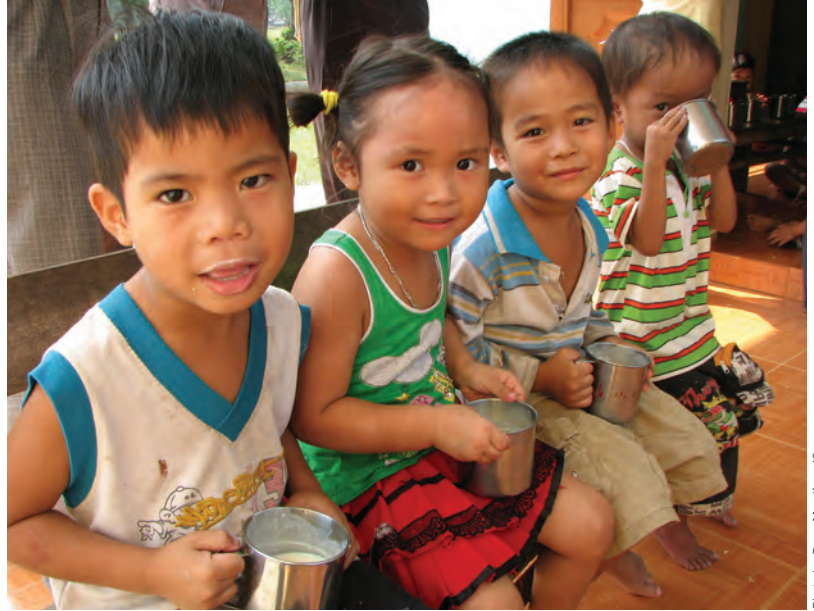
Children in the program receive nutritious soy milk twice a day

That's why AmeriCares, Abbott, the Abbott Fund and the Giao Diem Humanitarian Foundation run a preschool-based nutrition program in Vietnam for children under age 5 who are not yet part of government-sponsored school lunch plans. The program, which began in 2005 with 372 children, has since grown to include 3,200 preschoolers in some of the most remote and impoverished areas of the country. Twice a day, students are served peanut-fortified soy milk prepared daily by preschool staff. Each child's height, weight and iron levels are monitored throughout the year.