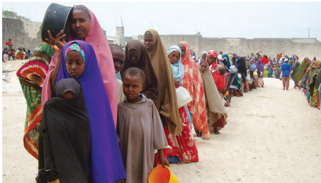
The devastating drought and famine in the Horn of Africa has forced tens of thousands to flee their homes in Somalia, walking across the desert for days in search of food and water

AmeriCares immediately rushed emergency medical aid for the thousands of starving and malnourished children and adults in Somalia this summer as the number of deaths in some parts of the embattled African nation reached famine proportions. We were among the first relief groups to send aid directly into Mogadishu, a dangerous place for aid organizations, but one of the neediest, with over 100,000 refugees in need of food, clean water and medical attention at the height of the crisis.