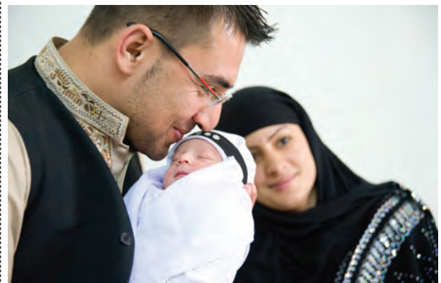
Middle right: A father meets his newborn baby girl at Afshar Hospital in southern Kabul, Afghanistan, which receives donated medicines and supplies from AmeriCares