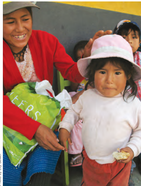
Mothers bring their children to see the doctors AmeriCares supports in Peru

Yangas is only two hours outside the capital, but it is a completely separate world. Most residents here are too poor to access health services in Lima and often talk about the city like it's another country. The medical brigades AmeriCares supports lessen this distance by bringing in skilled volunteer doctors to treat patients on weekends from sunrise until sunset.