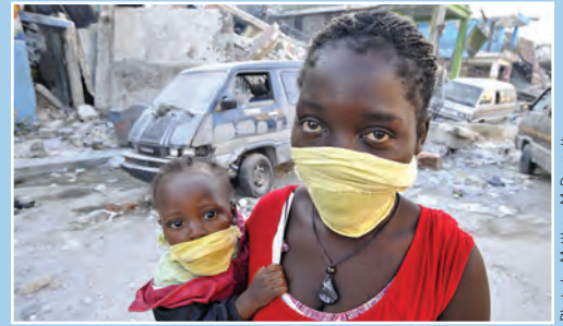
AmeriCares emergency pharmacy allows us to respond quickly to disasters